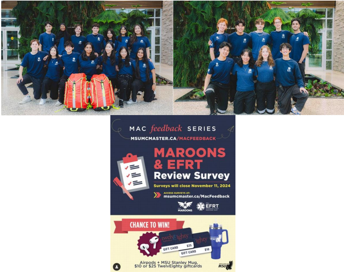
Figure 3: Recent EFRT Social Media Posts

Promotional materials have consisted of photos taken during the team photoshoot and a graphic for EFRT's service review survey.