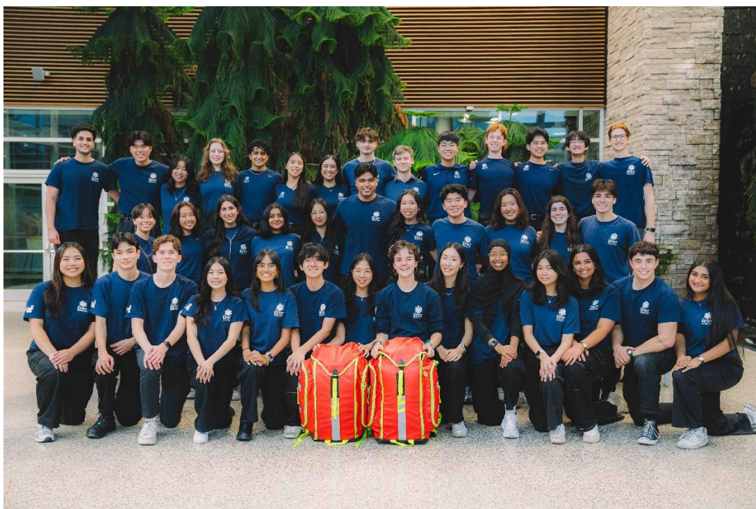
Figure 1: EFRT Team Photo 2024-2025

Through the planning of EFRT's PR Coordinator and the MSU Communications Team, a full team photoshoot was completed. Rookie headshots, first aid instructor headshots, and team photos were taken.