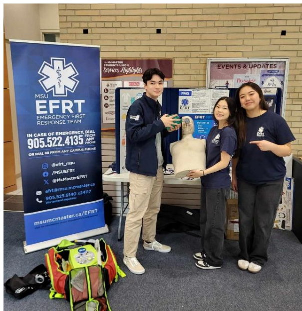
Figure 2: EFRT PR Booth

Through the planning function of EFRT's PR Coordinator as well as efforts from EFRT responders, EFRT conducted a PR booth. PR booths are conducted regularly outside of the EFRT office. Responders spoke with students about the EFRT service, taught them basic first aid skills, and handed out promotional materials such as magnets, pens, and hand sanitizers. EFRT's PR Coordinator has also been posting regular on social media.