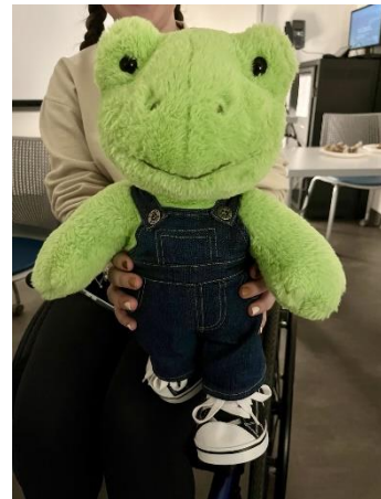
One of many stuffed animals!