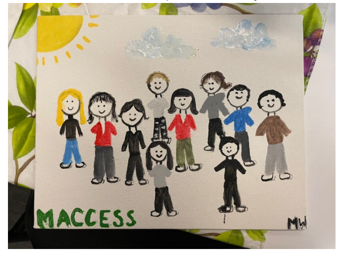
Project 1 – Disability Pride Week (On-Going/Planning)

One of our volunteers painted everyone who attended: