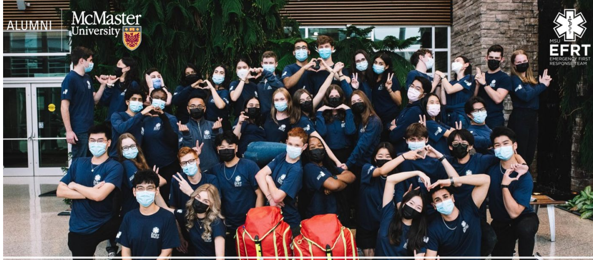
Emergency First Response Team 40 th Reunion